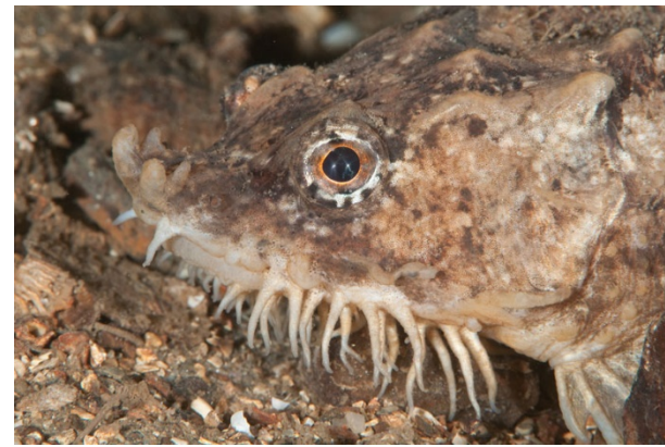
British Marine Life Pictures