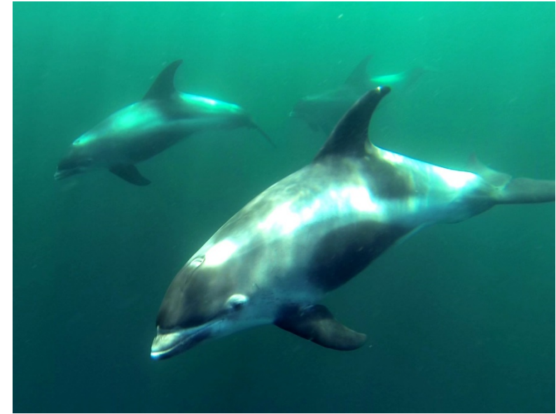
Sea Watch Foundation